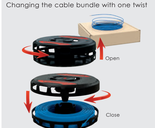
CB 260 Cable Box vertically / horizontally disconnect and connect Press the red buttons to release